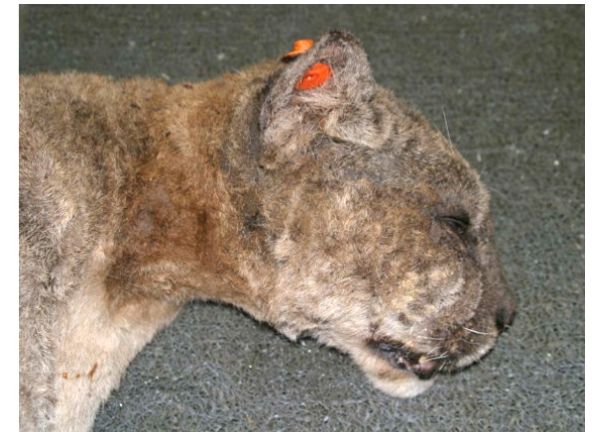
Simi Valley mountain lion before and after poisoning.