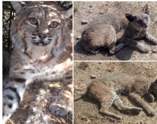
Healthy Griffith Park bobcat later found dying from eating prey that had consumed rodent poison.